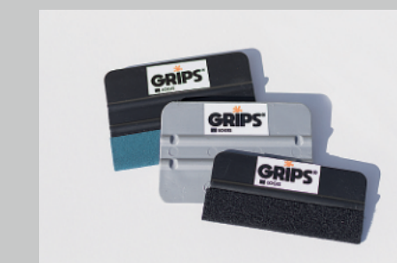
Squeegee For easy application of the foil