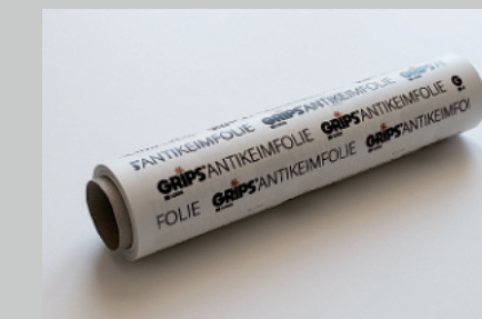
The LOGIS GRIPS® Antiviralfoil in various sizes

The Original Made in Germany Transparent & Self-adhesive